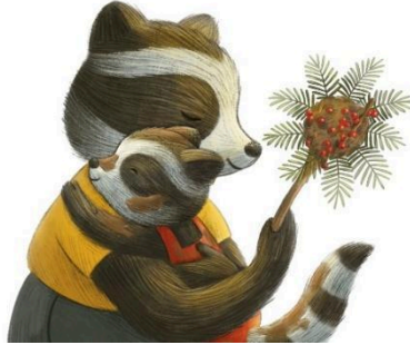
art © 2026 by Ramona Kaulitzki