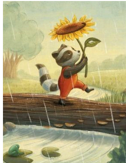
art © 2026 by Ramona Kaulitzki